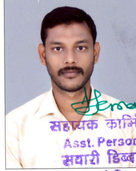
सहायक कार्मिक अधिकारी Asst. Personnel Officer सयारी डिब्बा कारखाना Integral Coach Factory चेन्नई / Chennai-600 038.