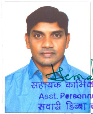
सहायक कार्मिक अधिकारी Asst. Personnel Officer सवारी डिब्बा बंगरखाना Integral Coach Factory चेन्नै / Chennai-600 038.