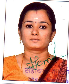
सहायक निर्यात अधिकारी Personnel Officer सवारी डिब्बा कारखाना Integral Coach Factory चेन्नई / Chennai-600 038.

कार्यालय आदेश सं /Office Order No.PB/S5 /47 Dated : 08/01/2019,