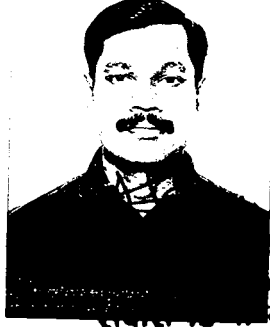
अधिकारी Personnel Officer कार्यालय आदेश सं/Office Order No.PB/S5/1925 Integral Coach Factory चेन्नै / Chennai-600 038.

कार्यालय आदेश सं/Office Order No.PB/S5/1925 Dated 25/10/2018.