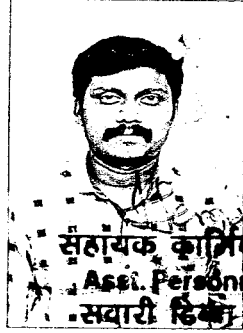
सहायक कार्मिक अधिकारी Asst. Personnel Officer सवारी डिप्टी कारखाना Integral Coach Factory चेन्नै / Chennai-600 038.

कार्यालय आदेश सं/Office Order No.PB/S5/1844 Dated : 15/10/2018.